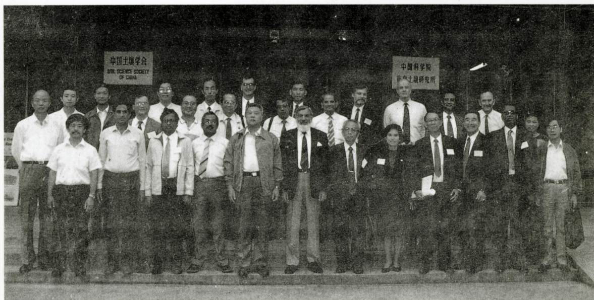
Participants at the ISPS