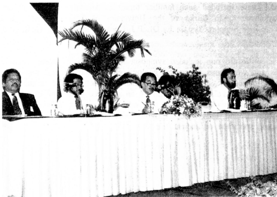
Speakers at the Soil Science Conference of Malaysia 1996, Kuching, Sarawak.

The elected committee members will serve the society for a period of 1 year, that is till the next AGM which is going to be held in Ipoh, Perak, Malaysia in April 1997.